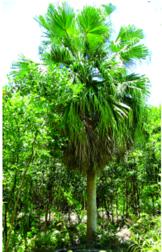
5. Livistona chinensis naturalized in coastal secondary forest of Saint-Philippe, La Réunion, Mascarenes.

However, we predict that more and more species will become naturalized and invasive in French Polynesia and the Mascarenes in the near future, and more generally in tropical islands worldwide as they are becoming very popular landscape and garden plants. The number of introduced species in these islands has dramatically increased in the last decades (Fig. 1). Also, an increase in the number of individuals per species, in the number of localities where they are planted (which together constitute the “propagule pressure” concept) and potential suitable habitat for their establishment and naturalization enhance the risk of invasion. Moreover, several palm species with small fruits ( Ptychosperma macarthurii in Fiji [Watling 2005], Licuala grandis and Dypsis madagascariensis in Tahiti, Washingtonia robusta in La Réunion) are actively dispersed by alien frugivorous birds,