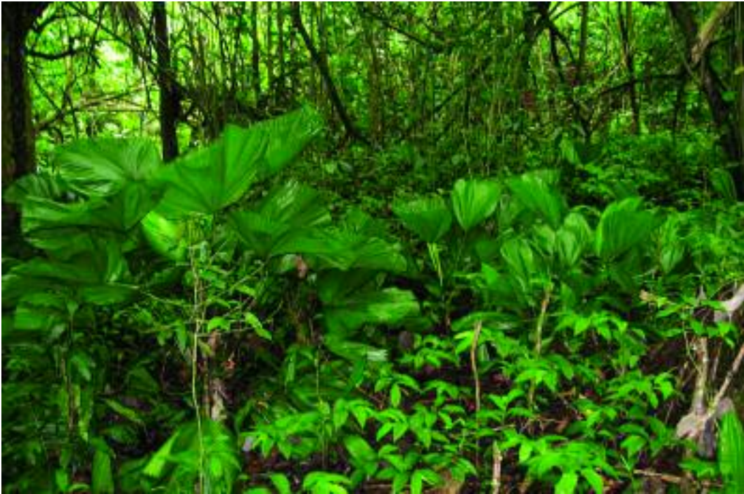
2. Seedlings of Licuala grandis in the understory of lowland rainforest on the island of Tahaa, French Polynesia.